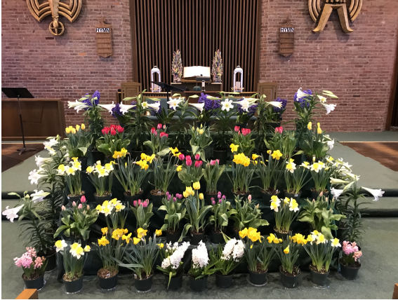
Easter Sunday at FPC Greenlawn