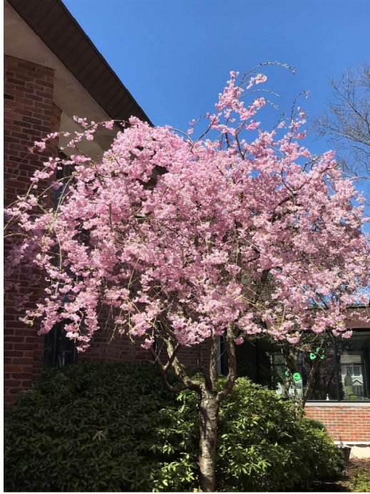
The lovely tree in our courtyard in full bloom.